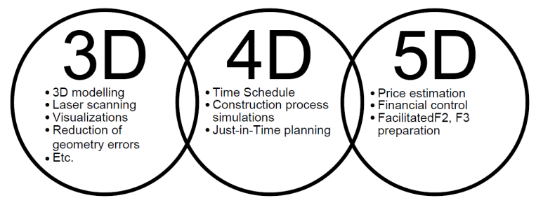
Fig. 1. Basic BIM Dimensions [13]

In different information sources different combination of these concepts is used for 6D and 7D BIM. Also, these concepts do not mean additional type of information integrated within a model, but rather extended uses of a model as well as software capabilities, therefore it is disputable whether term "dimension" is applicable.